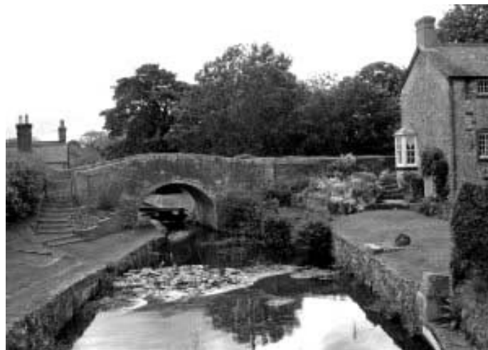
Carreghofa Lock near Llanymynech

Further information: tel. 01706 814998 email mrias@btinternet.com