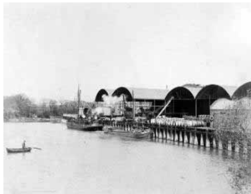
Bromborough Pool Docks